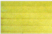
Polycarbonate Panels After 1000 Hours