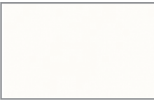
AcrylitGC Panels After 1000 Hours